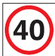
Code : RF24 600x600mm