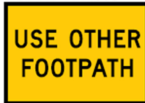
Boxed edge Code : RBE78 600x900mm