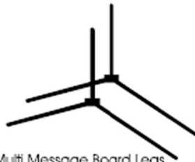
Multi Message Board Legs Code : RMMBLEG (Pair)