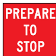
Code : RF62 600x600mm