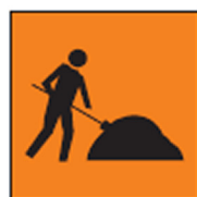
Code : RFD80 600x600mm

SIGNS FOR MULTI MESSAGE FRAME (Corflute)