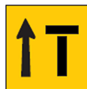
Code : RF18A 600x600mm