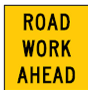
Code : RF64 600x600mm