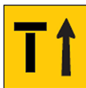
Code : RF18B 600x600mm