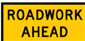
Boxed edge Code : RBEL64 1800x600mm