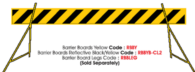
Barrier Boards Yellow Code : RBBY Barrier Boards Reflective Black/Yellow Code : RBBYB-CL2 Barrier Board Legs Code : RBBLEG (Sold Separately)