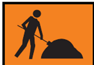
Boxed edge Code : RBEDR80L 600x900mm