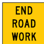
Code : RF23 600x600mm