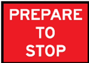
Boxed edge Code : RBE62 600x900mm

**BE SIGNS CAN BE USED WITH LEGS OR 600x900 SWING STAND AFM600