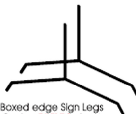
Boxed edge Sign Legs Code : RBELEG (pair)