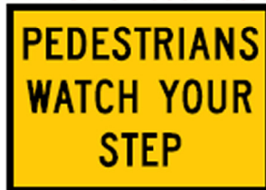
Boxed edge Code : RBE60 600x900mm