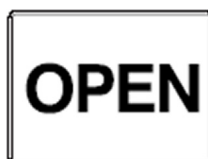
Back View MS55 poly 225x300