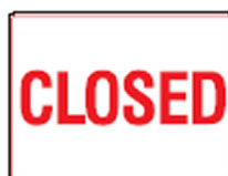
Front View MS55 poly 225x3600