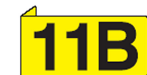
MASDSY (yellow) Double Sided MASY (yellow) Single Sided