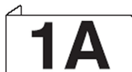
MASDSW (white) Double Sided MASW (white) Single Sided

Our flanged signs have a 90 degree bend so they can hang in aiseways.